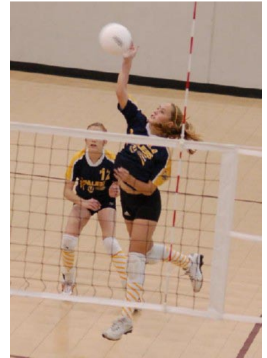
2008 Tourney Action !