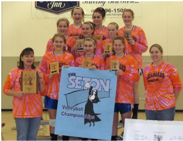
2008 “A” Champs: Holy Angels

For Catholic School Students throughout the Archdiocese of Milwaukee