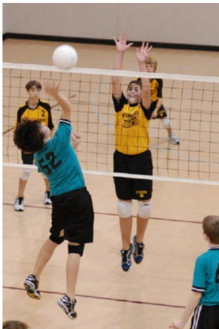
2008 Boys Division Action